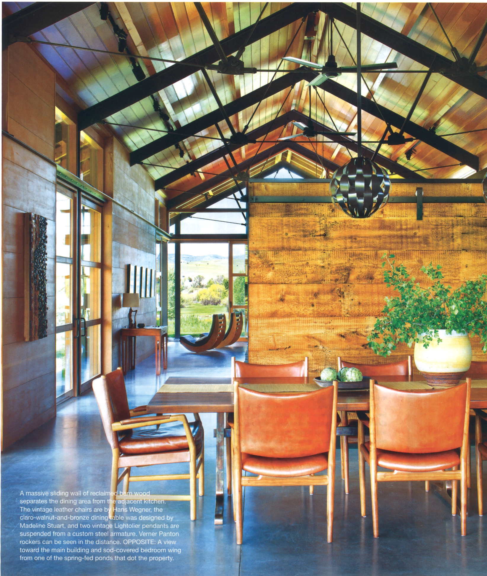
A massive sliding wall of reclaimed barn wood separates the dining area from the adjacent kitchen. The vintage leather chairs are by Hans Wegner, the claro-walnut-and-bronze dining table was designed by Madeline Stuart, and two vintage Lightolier pendants are suspended from a custom steel armature. Verner Panton rockers can be seen in the distance. OPPOSITE: A view toward the main building and sod-covered bedroom wing from one of the spring-fed ponds that dot the property.