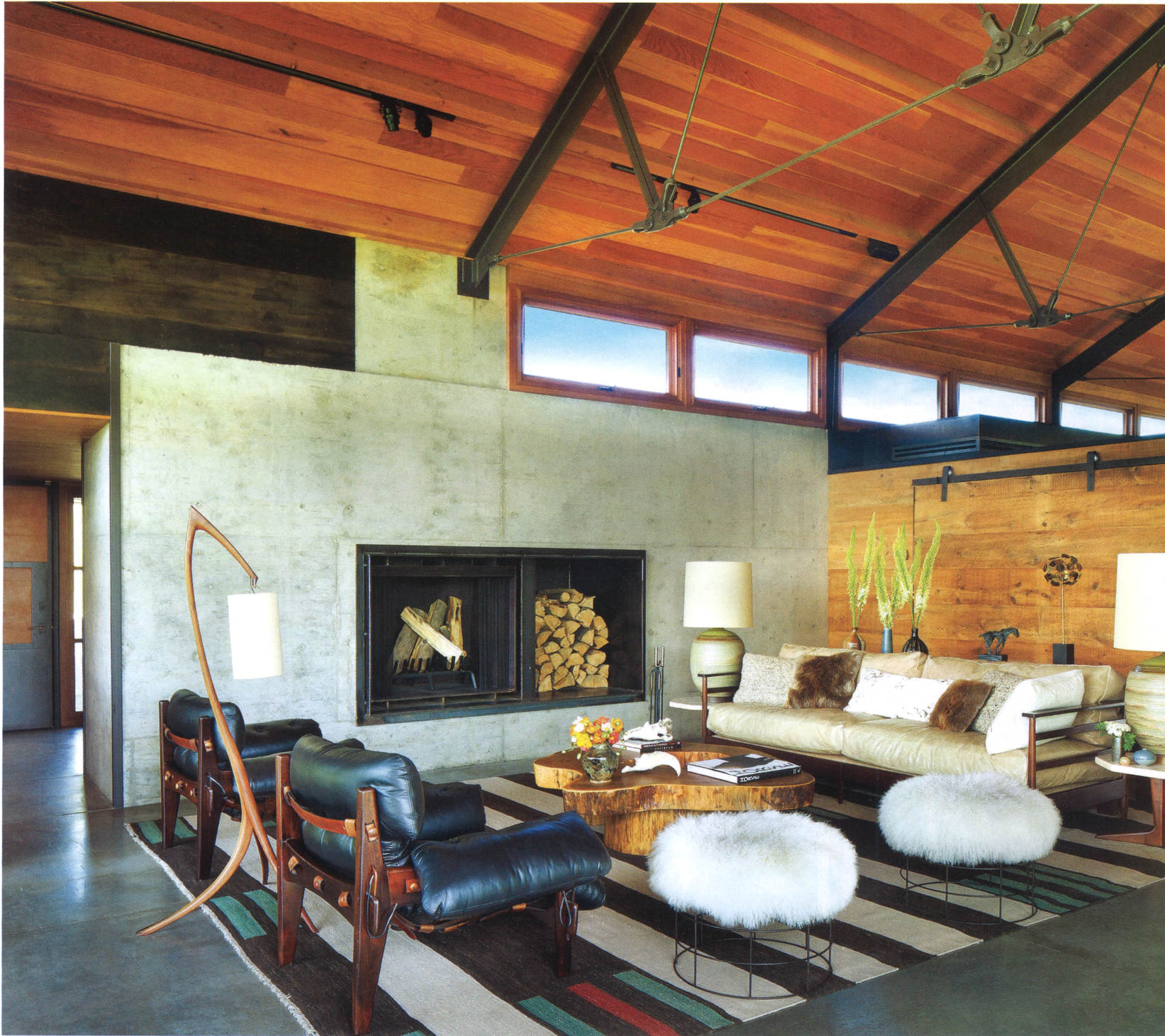
ABOVE: In the main living area, board-formed concrete walls contrast with the skeletal steel structure, painted in Pratt & Lambert's Obsidian. A pair of Sergio Rodrigues leather-and-rosewood chairs from the 1970s were the first pieces purchased for the project. The Mongolian-lamb-and-iron stools, Navajo-inspired wool rug and leather-and-rosewood sofa are custom pieces by the designer. OPPOSITE: The screened porch is anchored by a massive black-steel-and-concrete fireplace and furnished with a mix of vintage and custom pieces that can easily withstand the elements. Perennials fabrics were used for the cushions, and the coffee table's 600-pound stone slab was sourced at a local quarry.